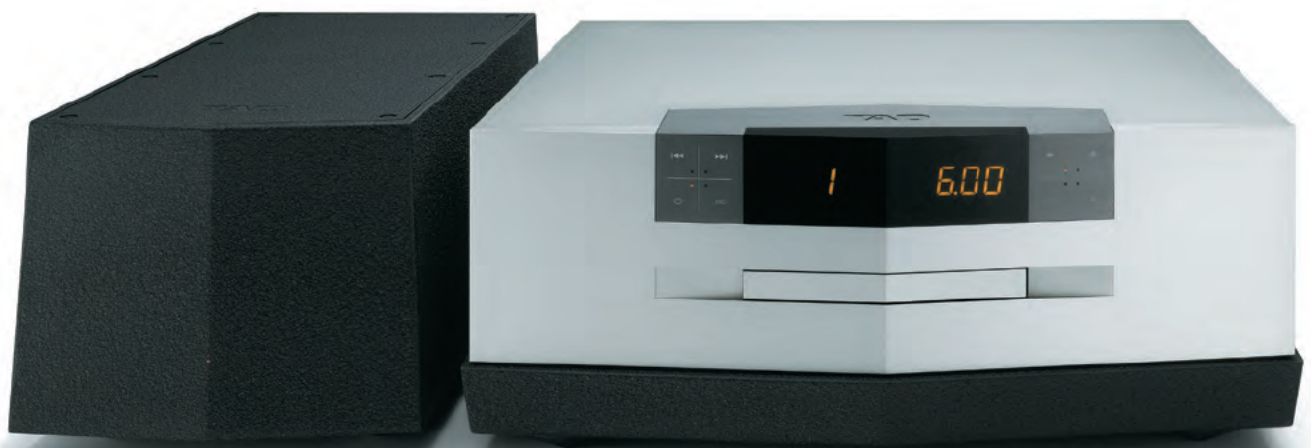
DISC PLAYER D600