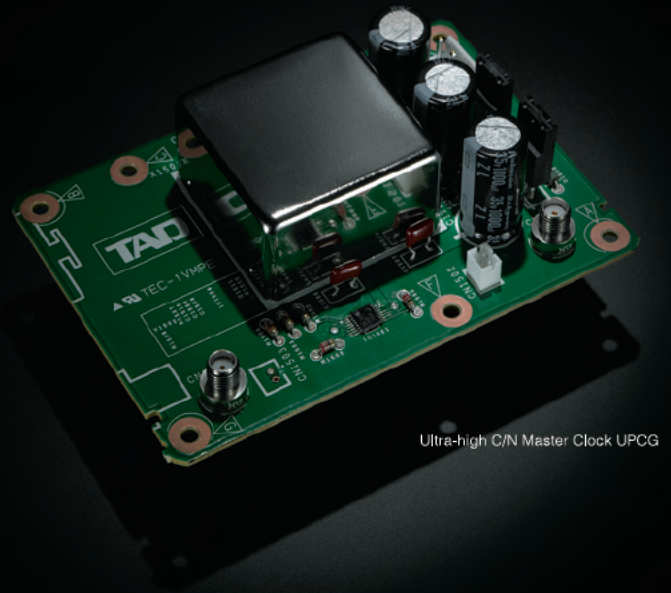
Ultra-high C/N Master Clock UPCG

The D600 employs a new proprietary crystal oscillator that improves noise level more than 50dB compared with conventional players, attaining ultra-high C/N characteristics. TAD focused specifically on C/N in order to provide the most accurate sound reproduction capability, aiming to thoroughly reduce jitter in the low frequency sideband ranges relative to the center frequencies. TAD developed the crystal oscillator in co-operation with a crystal manufacturer. Based on technologies developed for high-speed digital base station relay facilities this produces an oscillator perfect for the D600.