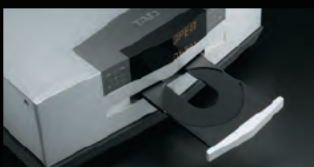
Aluminum disc tray

Realizing the ultimate in reproduction accuracy also required an innovative design for the CD/SACD mechanism. It features high stiffness, smooth operation and superior vibration control properties thanks to a precise loading mechanism equipped with metal shaft bearings. The pickup employs an infinite conjugate optics system, ensuring both stable operation and high reading precision. The highly-rigid disc tray is formed from precision-machined aluminum to further minimize vibration. A black sheet on the tray both restricts the scattered reflection of laser light to increase reading precision and contributes to vibration control.