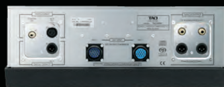
Main unit rear panel