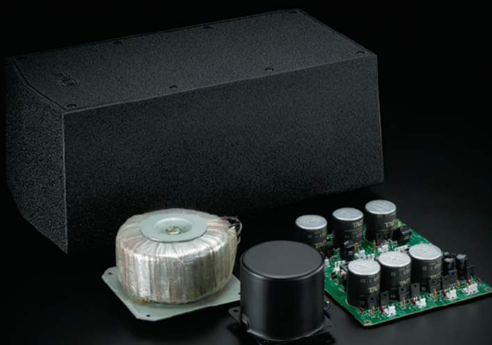
High capacity power supply

DAC mode provides high precision when used as a D/A converter.