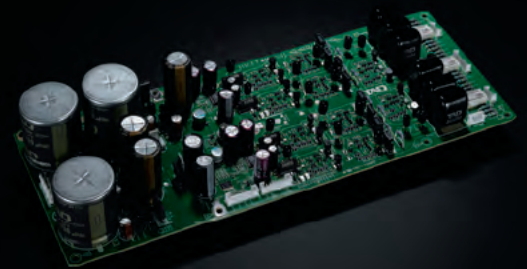
Audio output circuit

Two Burr-Brown PCM1794s, a well respected high performance DAC, are connected in parallel in a balanced configuration. This improves audio performance in all metrics including S/N ratio, linearity, dynamic range, and distortion. The result is that even delicate audio sound nuances are reproduced faithfully, creating a greater degree of realism in the music.