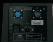
Power supply rear panel